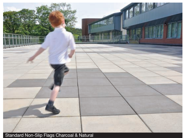
Standard Non-Slip Flags Charcoal & Natural