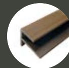
End trim F-shaped