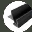
Outside corner trim