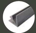
Inside corner trim