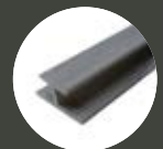
Joining trim I-shaped