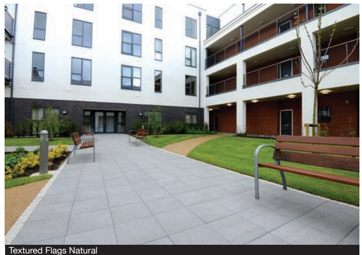
Textured Flags Natural