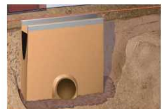
Knock out pre-formed outlet from the inside (marked with hammer symbol) and trim edges with a chisel. Fit outlet connector and sump. Position sump and outlet channel on concrete bed, fit PVC-U union/trap to drainage pipework.