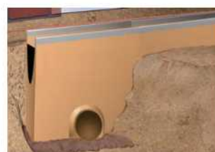
Lay channels starting from outlet/sump, ensuring joints connect by lowering units horizontally. Fit end caps to end channel. For watertight joints**, use a suitable sealant (contact ACO for further advice).