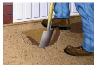
Dig trench 400mm wide, see chart opposite for channel and sump depths*. Mark finishing height with fixed line 3mm below final surface. Lay 150mm (min.) bed of concrete.