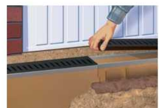
With gratings fitted, haunch around channels/sumps with concrete. Final surface to be 3mm above grating. Bricks/paviours should be laid in mortar for lateral stability.